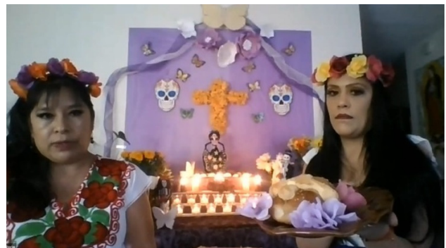
Day of The Dead as a Result of DV by C4DP 2020